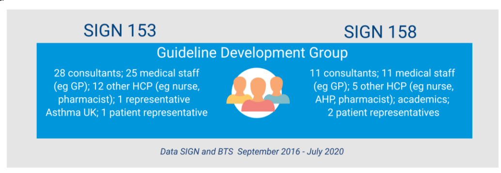
Figure 4: Members of the group developing the SIGN/BTS British guidelines on the management of asthma

A total of 65 HCPs on the GDG Steering Committee and GDG Evidence Review Groups (ERG) were involved in the development of SIGN 153. Of these, 47 (72%) were based in England, 17 (26%) in Scotland and 1 (1%) in Wales.