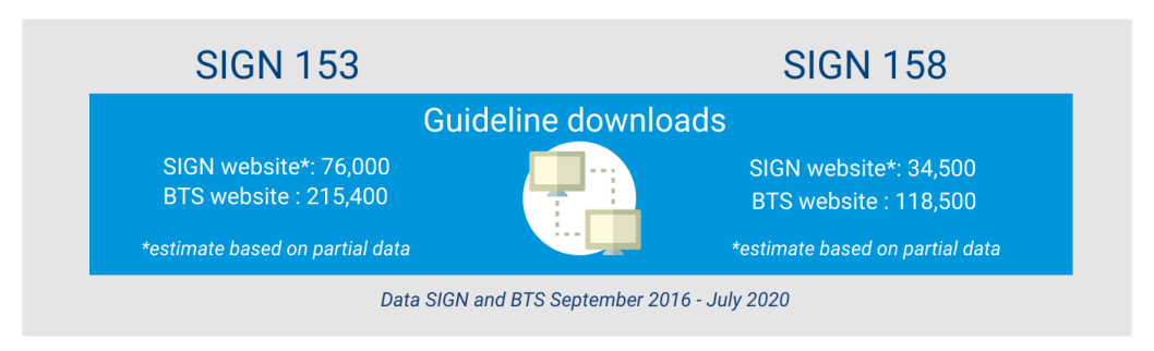
Figure 2: Downloads of the SIGN/BTS British guidelines for asthma from SIGN and BTS websites

When looking at the detailed download data for SIGN 153, there were 19,207 downloads from the SIGN website for the eight months from June 2017–January 2018, and 13,668 downloads for the seven months from January 2019–July 2019. As a result of the migration of the website, download data for the other months are not available. It was estimated that SIGN 153 was downloaded