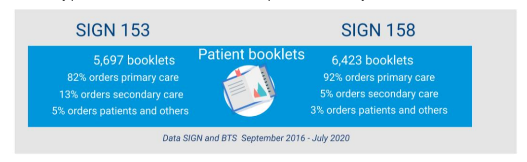
Figure 1: Number of patient booklets distributed in response to orders from stakeholders

The number of patient booklets that were distributed in response to orders received by SIGN for each of the stakeholder groups is shown in Figure 1 .