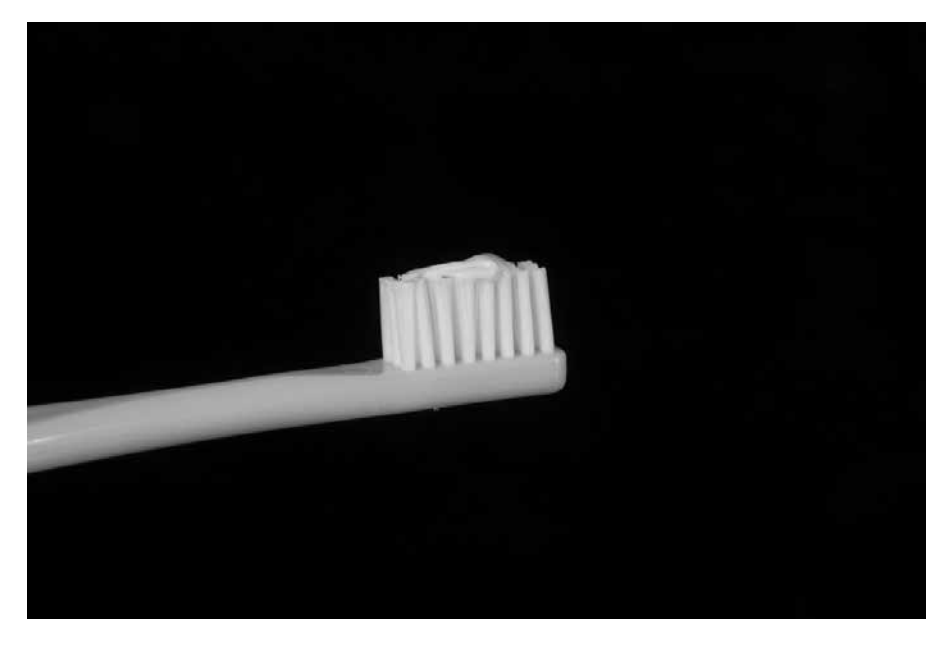
Figure 1: Smear of toothpaste (approximately 0.1 ml) representing the recommended volume for children under the age of three years

Brushing with a smear of 1,000 ppmF toothpaste involves 0.1 ml x 1 mg F/g = 0.1 mg F.