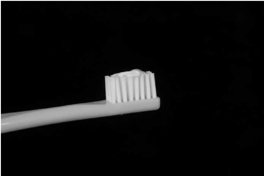
Figure 1: Smear of toothpaste (approximately 0.1 ml) representing the recommended volume for children under the age of three years

Brushing with a smear of 1,000 ppmF toothpaste involves 0.1 \text{ ml} \times 1 \text{ mg F/g} = 0.1 \text{ mg F} .